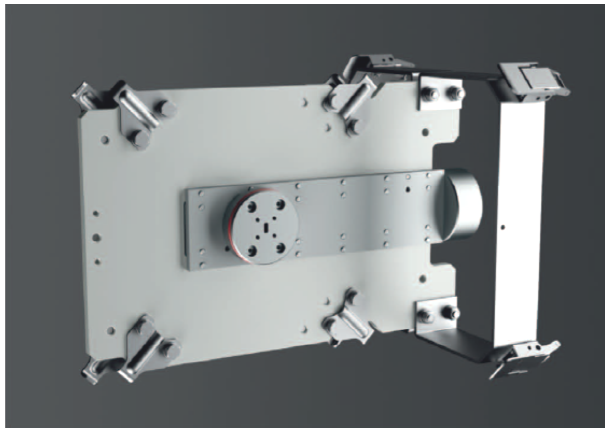
Faini's Hybrid Coupler